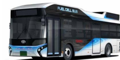
Toyota FC Bus